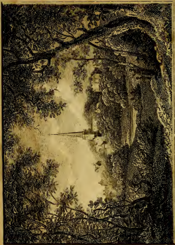
Ida ! blest spot, where Science holds her reign !